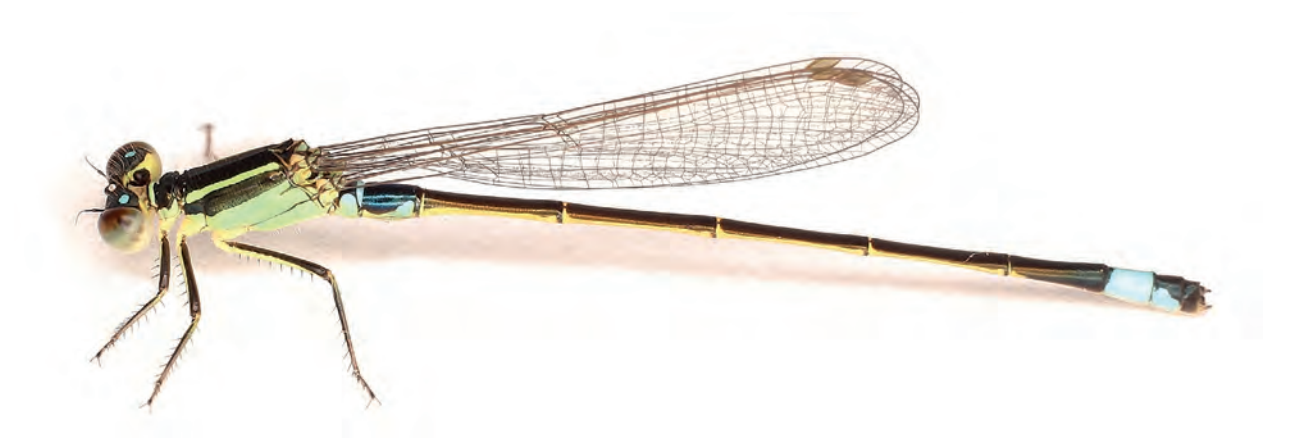
Figs 1. The voucher of Ischnura senegalensis (male, in live) from Bonn, Germany (ZFMK no. pending).